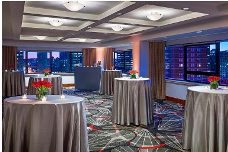
Sample symposium room @ The Westin Copley Place available on 9/23/22

There will be two rooms available for lunchtime ONLY (noon-1 PM) exhibitor-organized non-CME presentations. You would be able to bring in your own speakers and equipment, arrange the room and cater the event as desired. Room capacity is up to 40 participants. The only restriction would be that both lunch-time lectures would need to address different ophthalmology specialties. The symposium package also includes two display Exhibit tables on the day of your symposium. Room and topic selection will be confirmed on a first come first-served basis.