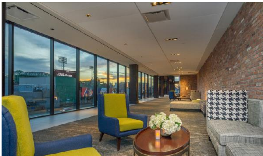
General Exhibit Area for the 12/9/22, 3/3/23, and 6/2/23 Meetings (2 nd floor @ Hotel Commonwealth)