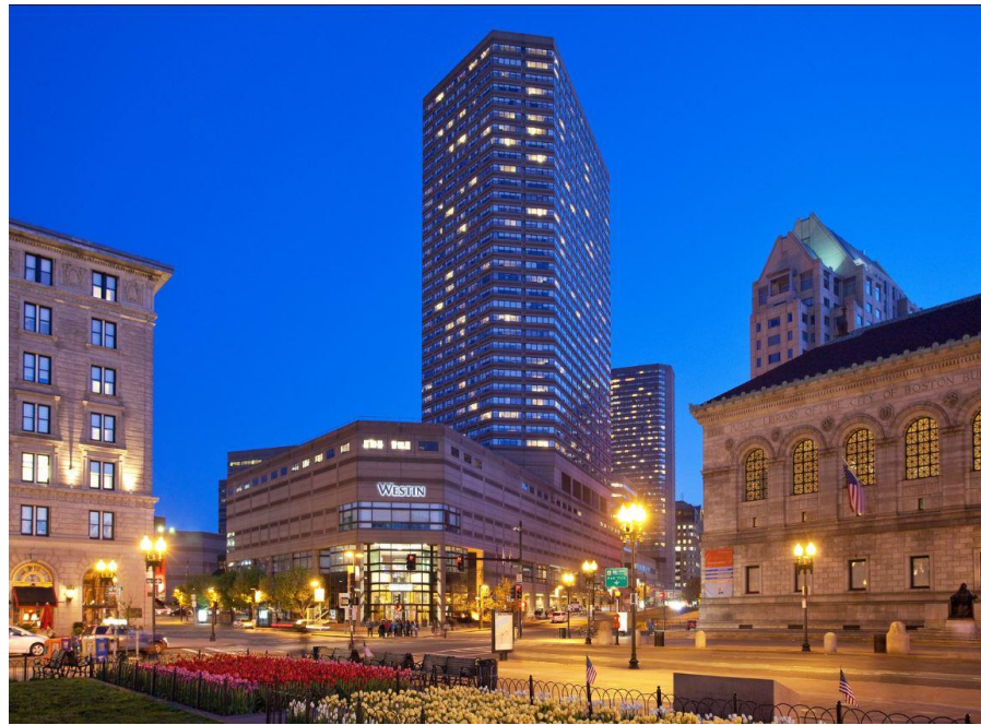
The Westin Copley Place (Boston) – September 23 rd meeting