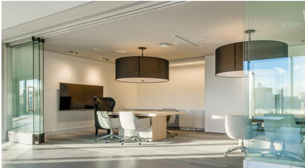
Platinum Exhibitor Sponsor Room @ Hotel Commonwealth available for the 12/9/22; 3/3/23 and 6/2/23

There is one glass-walled room in the middle of the exhibitor space at Hotel Commonwealth that will be available for the entire day on Dec 9 th , Mar 3 rd , and June 2 nd . This room has an HD Monitor for video streaming, two tables with 4 chairs each, and refrigerators for drinks. This space is only available for one sponsor and is offered on a first come first served basis.