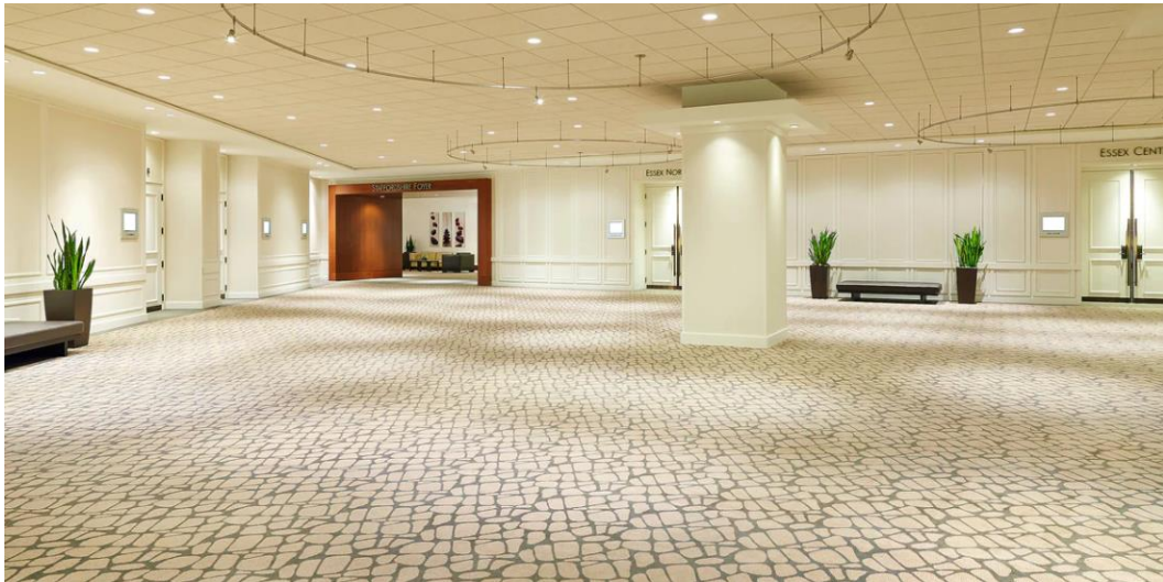
General Exhibit Area for the 9/23/22 Meeting (3 rd floor @ The Westin Copley Place)