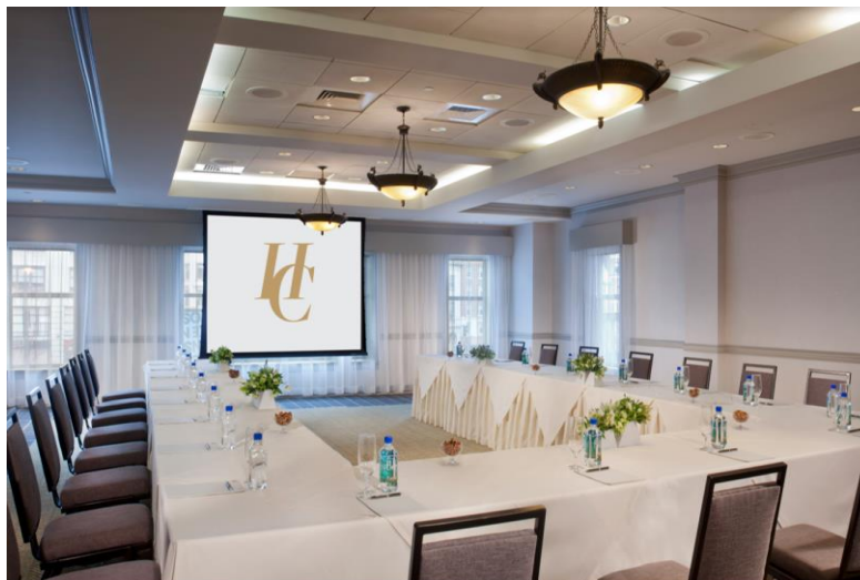
Sample symposium room @ Hotel Commonwealth available on 12/9/22; 3/3/23 and 6/2/23